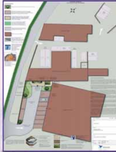
'Parkwood External Refurbishments'

During the first months of 2009 the landscape architectural team have won and completed a variety of design commissions including the refurbishment of the externals to a crematorium in Weymouth, Cherwell Spiceball Leisure Centres landscape management plan on behalf of Kier-Moss Ltd and Barratt Homes Sales Arena hard and soft landscape design in Bodmin. All of which have been well received by the respective Client. Business development has been a key focus for us this quarter. Marketing strategies have been reviewed, existing working relationships cemented, new and existing markets and services explored such as Landfill, Waste and Planning