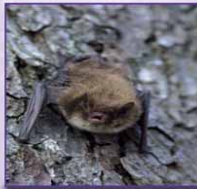
'Habitat Regulations changes: Bats'

As the 2009 Ecological survey season gets underway, it's worth brushing up on some legislation revision. During 2007 significant changes to the Habitat Regulations came about, including the removal of many of the defences, which could previously be relied upon. In particular the defence regarding acts "which are an incidental result of a lawful activity and which could not reasonably be avoided" has been removed. An example scenario would be: A grounds maintenance contract manager